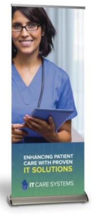
Deluxe Adjustable Retractor Display

Attract attention and direct traffic. Lightweight and easily moved, standing signage gives planners and exhibitors much-needed flexibility and can be used throughout the hotel.