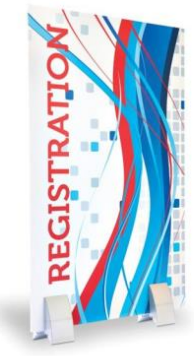
Meter Board With Display